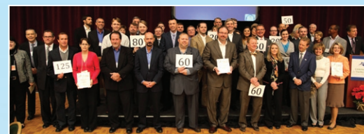
Milestone Honorees Represent 545 Years of Success!