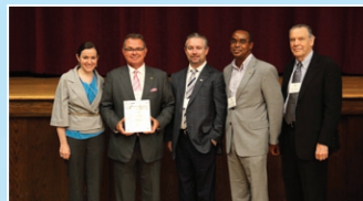
ms consultants celebrated a 50-year anniversary