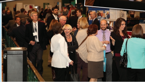
Conway Center members enjoy networking at the inaugural Family Business Expo