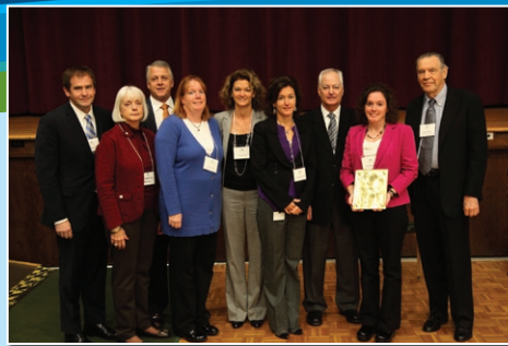
White Castle Received the Communication and Family Business of the Year Awards