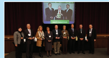
Special Support of Family Businesses and the Conway Center Honorees