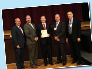
Schoedinger Funeral & Cremation Service received a Succession Award